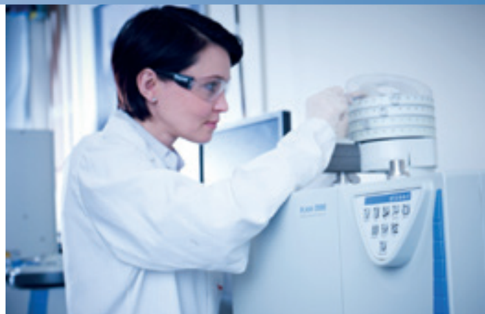
Figure 1. FLASH 2000 Nitrogen/Protein Analyzer

The globalization of the food market requires accurate and reliable control of the characteristic of products for the protection of commercial value, but mainly to safeguard consumer health and manufacturer reputation. Official